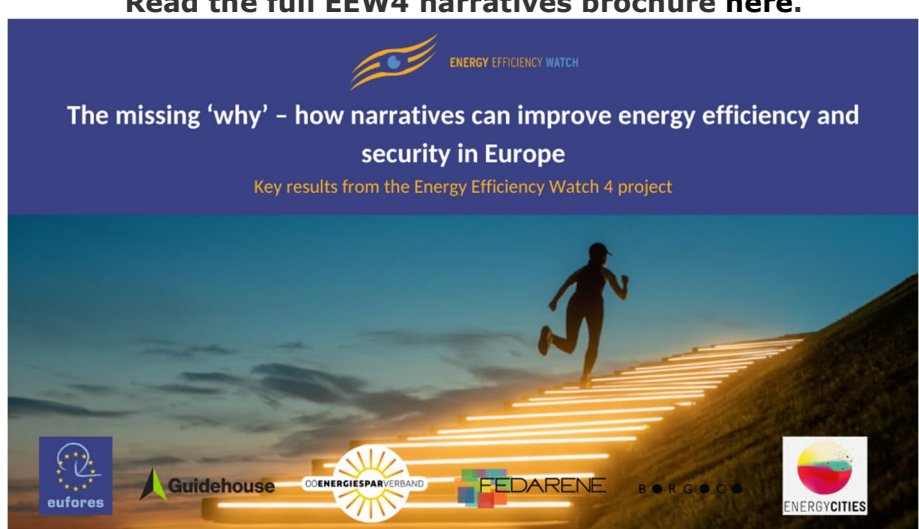
Read the full EEW4 narratives brochure here.

• The energy crisis related to the Ukraine war shows that energy efficiency has a high potential for energy security. To our surprise, the argument did not make it to the top five topics of the EEW4 survey. This does not mean that EEW4 results are outdated, but on the contrary allows for insightful additional conclusions: energy security has not been taken serious in the past, this is caused by a structural predominance of the supply side in the perception of what constitutes energy security, and a deep-rooted belief in economically rational behaviour as guiding principle for international energy relations. The EU must live up to its "energy efficiency first" principle and must aspire to more ambitious policies and according narratives.